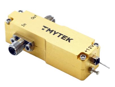
Figure 1. Connectorized Amp Photo